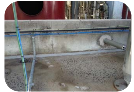
Concrete wall suffering from weather and UV degradation sealed with Resichem 505 Damp Seal