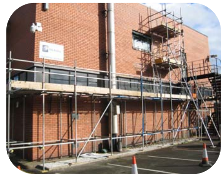
Training facility in the UK was refurbished using Resimac corrosion protection systems. All surfaces were mechanically abraded and primed with 506 Aluprime and top coated with 508 UVPU