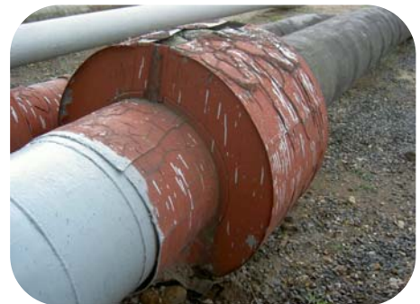
Badly corroded pipe surfaces were hydro-blasted at a European refinery and coated with 2 x coats of Resichem 501 CRSG to give long term protection against CUI