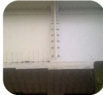
Bridge over UK rail line mechanically abraded and coated with 2 x coats of Resichem 501CRSG. Once cured Resichem 508 UVPU was applied to give a UV resistant finish