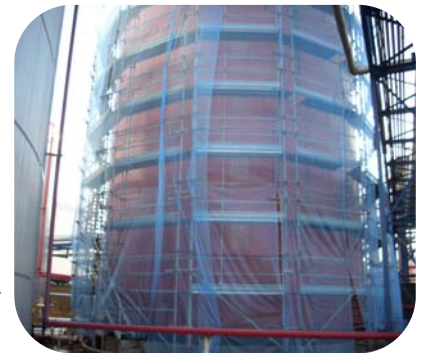
Petrol storage tank at European refinery hydroblasted and coated with 2 x coats of Resichem 555 Resinox