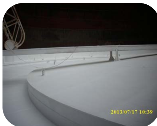
Floating roof on crude oil tank hydro blasted at 1000psi, primed using 506 Aluprime and over coated with 554 RB membrane