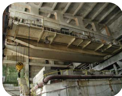
Gantry crane in a chemical facility was mechanically abraded and coated with Resichem 501 CRSG