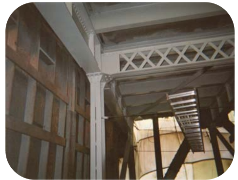
Structural steel underneath a water tank abrasive blast cleaned and coated with Resichem 501 CRSG

This material can be used to resurface and protect—