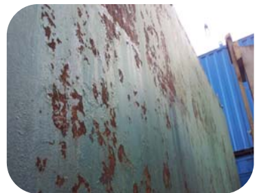
Diesel storage tank at a UK marina was badly corroded due to the corrosive environment. The external tank surfaces were mechanically abraded and protected using Resichem 501 CRSG.