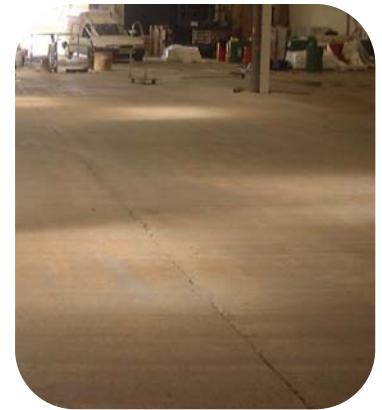
Concrete surface primed using Resichem 503 SPEP prior to application of Resichem 501 CRSG